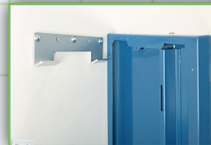
Wall-mount hanging set-up made easy by hooking table onto hanger