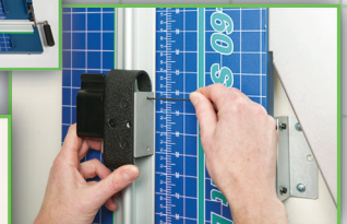
Cutting head carriage is field adjusted keeping head above material prior to cutting