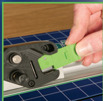
Knife Blade Cartridge easily and safely inserts into the cutting head