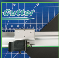
Built-in Material Squaring Arm