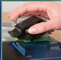
"Lock and Cut" feature – button reset